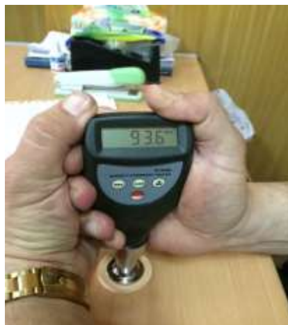
Fig. (1): Testing procedure : Digital hardness tester used to measure surface hardness of stone sample

Conflict of interest: the authors have no conflict of interest with any organization or institute.