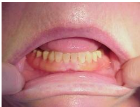
- Flexible partial denture

mouth and must plan every detail of treatment. Nor can it meet all the requirements of a challenged mouth. The key is to solve and address as many problems and needs as possible in a simple way that is affordable for the patient. An effort has been made to focus on improvements over conventional partials in aesthetics, function, durability, and longevity of a Partial denture made from a flexible denture material. With further improvisations in the working techniques, adjustments and repair potential of the material, Flexible partials y become a simpler answer to complex partially edentulous oral conditions.