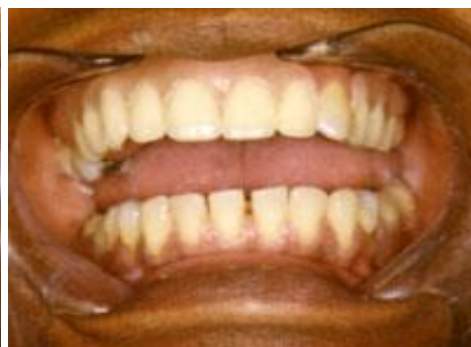
B- New Partial Without Visible Wires