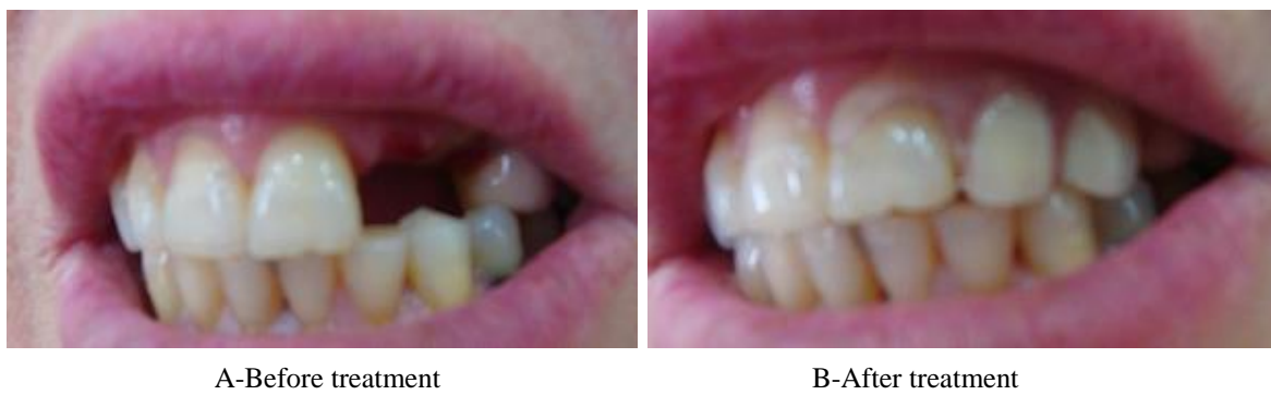
Fig.(4): -A-Before and B-After treatment, Flexible partial denture.