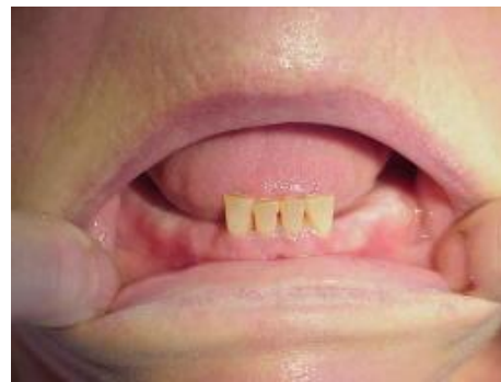
- Mucosa-after treatment