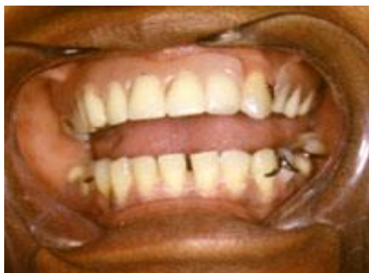
A- Old Partial